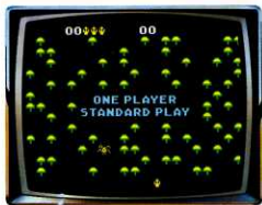
Figure 6 - Player and Game Select Display (Menu)

Move your joystick in the same direction you want to move your magic wand. You can move a